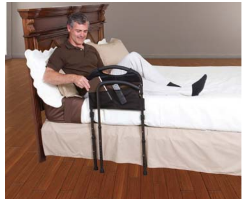
ORGANIZER KEEPS ITEMS CLOSE BY