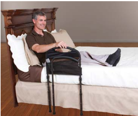
EASILY SIT UP IN BED