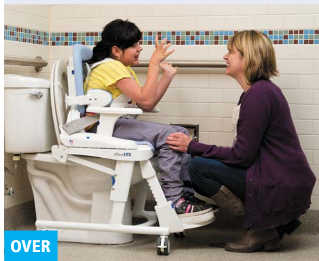
... OVER the toilet, attached to a mobile economy base...