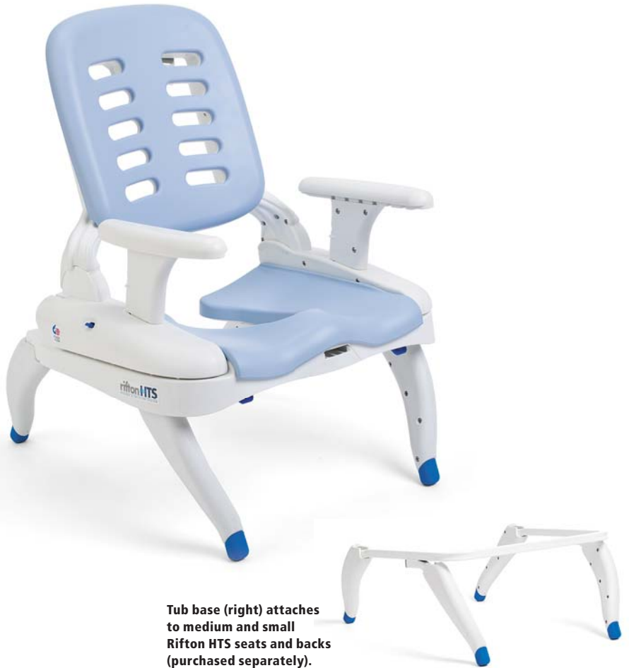
Tub base (right) attaches to medium and small Rifton HTS seats and backs (purchased separately).