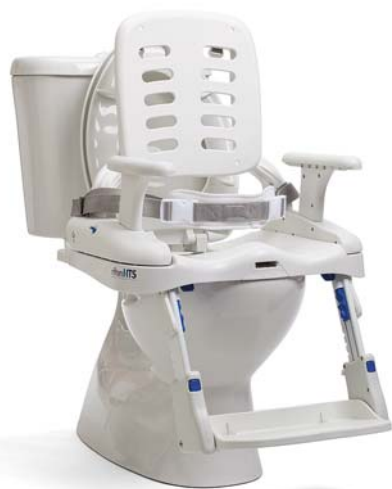
Above: The basic HTS (medium) with seat, back, seat belt and armrests