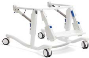
Mobile (tilt-in-space with footboard)