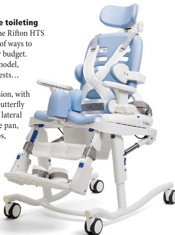
Above: The fully accessorized medium HTS

...to the fully accessorized version, with seat and back pads, headrest, butterfly harness, anterior support/tray, lateral supports, hip guides, commode pan, deflector, abductor, ankle straps, calfrest and footboard.