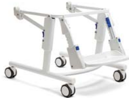
Mobile (non-tilt with footboard)