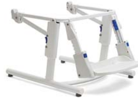
Stationary (non-tilt with footboard)