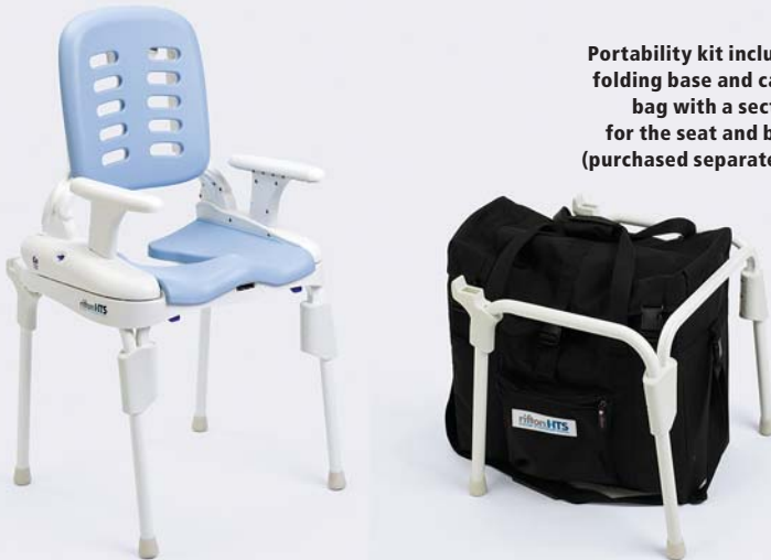
Portability kit includes folding base and carry bag with a section for the seat and back (purchased separately).

The portability kit gives children greater independence—and their families greater freedom to travel—by enabling them to take the Rifton HTS on the road. Lightweight folding frame and carry bag (for small and medium sizes) make toileting possible while traveling. Eliminates contact with public toilets for better hygiene. Note: The folding base is designed for use in exceptional situations, not as the primary base.