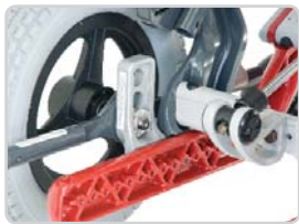
Adjustable seat height

TREND-SETTING FRAME COLORS. YOU CAN ORDER CUSTOM COLORS TOO. CONTACT US FOR DETAILS.