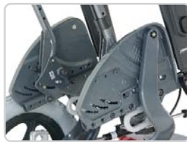
Adjustable seat depth and back rest