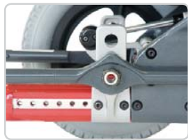
Adjustable axle position