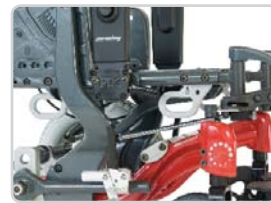
Transit tie downs