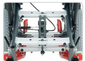
Adjustable seat width

Seat width (adjustable) 12"–18" Seat depth (adjustable) 13"–18" Seat height (adjustable) 13"–20" Back angle (adjustable) 90°–120° Back height 20" and 25" Dynamic tilt 50°