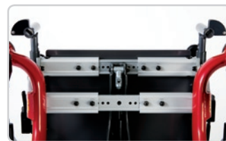
Adjustable chair width

Seat width (adjustable) 13" – 20" Seat depth (adjustable) 15" – 20" Seat height (adjustable) 13" – 20" Back angle (adjustable) 90° – 120° Back height 20", 25" Dynamic tilt -5° to 20°