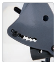
Adjustable back angle

TREND-SETTING FRAME COLORS. YOU CAN ORDER CUSTOM COLORS TOO. CONTACT US FOR DETAILS.