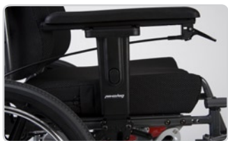
Available with self tilt option