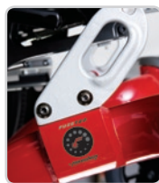
Optional transit tie-downs