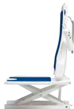
LIGHTEST BATHLIFT AVAILABLE