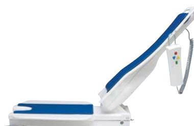
RECLINING BACKREST LOWEST BATHLIFT AVAILABLE