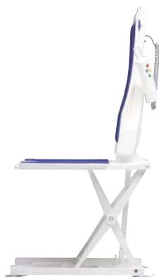
HIGHEST SEAT POSITION