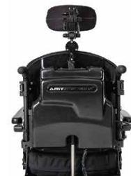
New Back Cover

The Quickie® Xplore 2™ is the most hybrid product available. This wheelchair offers the best of both worlds; the traction of a rear wheel drive and the short turning radius of a mid-wheel drive wheelchair. The fast speed of the Xplore 2™ makes it the ideal choice for someone spending a lot of time outdoors and who wants to go the distance. Safe and comfortable, the 6-wheel independent suspension is offered in Standard and Heavy Duty. The wheelchair come standard with transport brackets. Seat options: tilt, manual and power recline, and elevating seat.