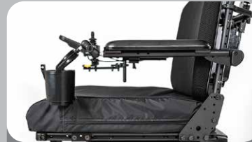
Coffee Cup Holder