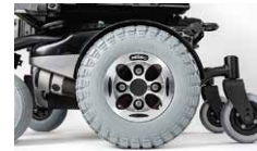
New Wheel option