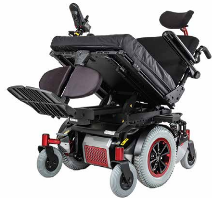
Heavy Duty Tilt