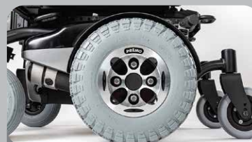
New Drive Wheel

Please see order forms for a complete list of options