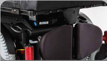
Infinite adjustment center mount -5° to 70°