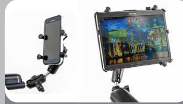
Phone & Tablet Support