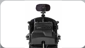
New Back Cover