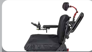
New cantilever armrest opens with 5° angle