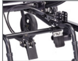
Foot Release Tilt Actuator