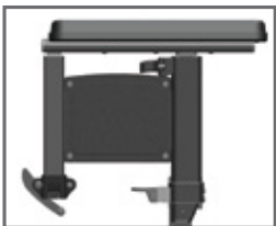
Low Profile Dual Post Armrest