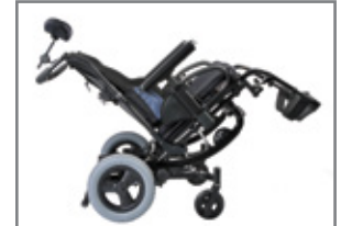
SR45 with additional seating