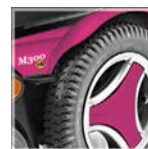
POP STAR PINK