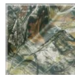
REALTREE AP CAMO