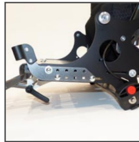
Retainer standard with grab rail or tray