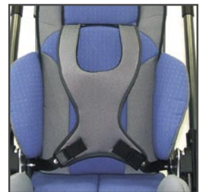
Chest-shoulder harness IUS only