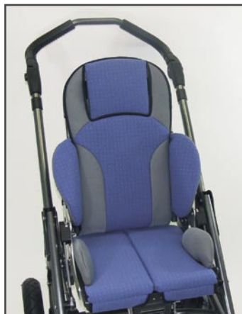
Upholstery colour: Blue / Grey