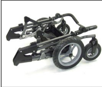
Compact folding size

The BINGO Evolution is the result our goal of continuous product development. The BINGO was good - we just made it better!