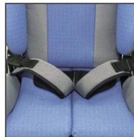
Groin strap IUS & XPS