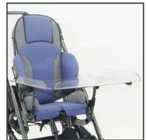
Therapy tray grey or clear IUS & XPS