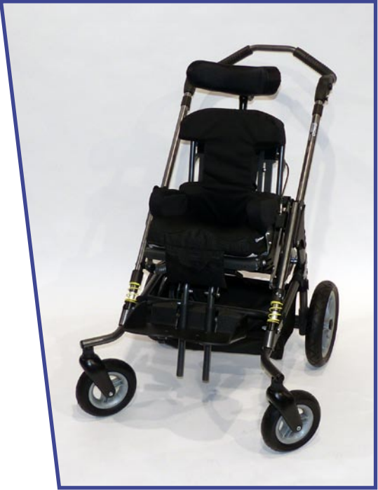
BINGO XPS Extra Positioning System