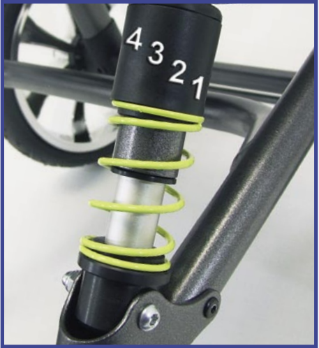
BINGO Evolution - ASS Adaptive Suspension System