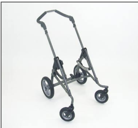
Frame colour: sparkling iron effect