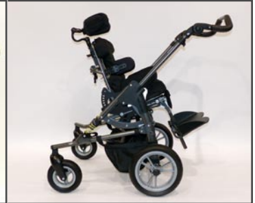
Seat in rear facing