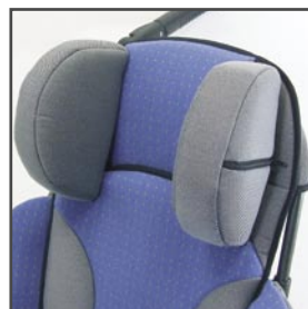
Headrest pads IUS only