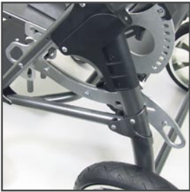
Bus Transport Package Standard (ISO 7176-19)