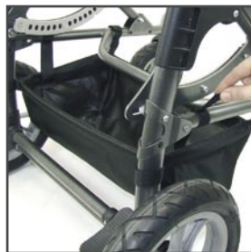
Soft Accessory Bag Standard (max. 3 kg)