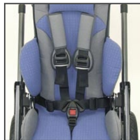
Five-point harness IUS only