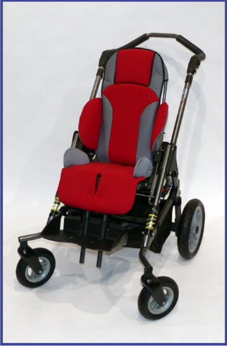
BINGO IUS Individual Upholstery System