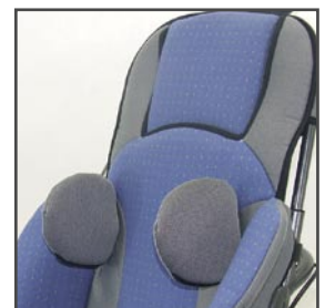
Lateral trunk supports IUS only