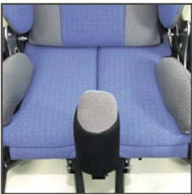
Abduction block IUS only