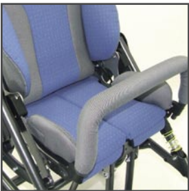
Grab rail with upholstery IUS & XPS