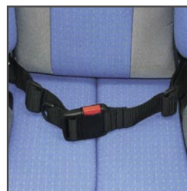
Lap belt IUS & XPS