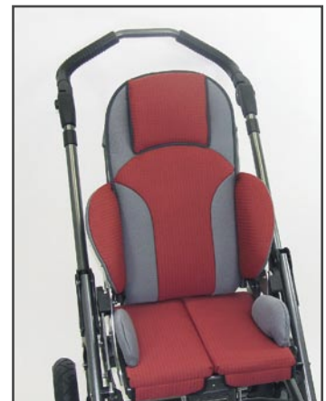
Upholstery colour: Red / Grey