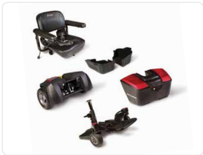
One-hand "Feather Touch" disassembly

The all-new Go-Chair is re-engineered from the ground up, offering a bold new style available in an array of contemporary colors. Enhanced performance and comfort, along with feather-touch disassembly, allows you to enjoy light-weight travel and independence on the go. With an increased weight capacity of 300 lbs. and a sleek, bold look, the new Go-Chair makes travel easy.